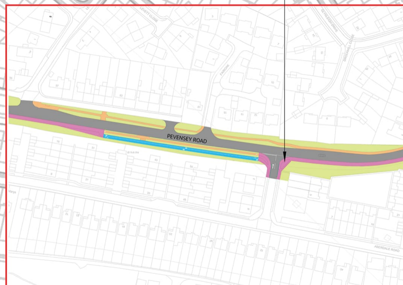
SHEET 3 OF 6