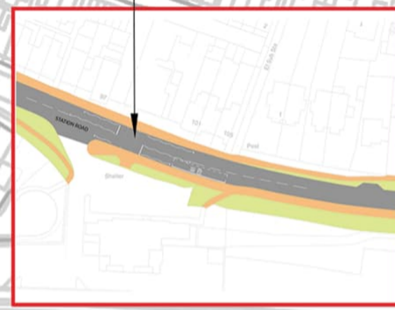
SHEET 2 OF 6

EXISTING FOOTWAY ON SOUTHERN SIDE OF PEVENSEY ROAD BETWEEN ABERDALE ROAD AND LYNHOLM ROAD TO BE IMPROVED TO A SHARED FOOTWAY/CYCLEWAY