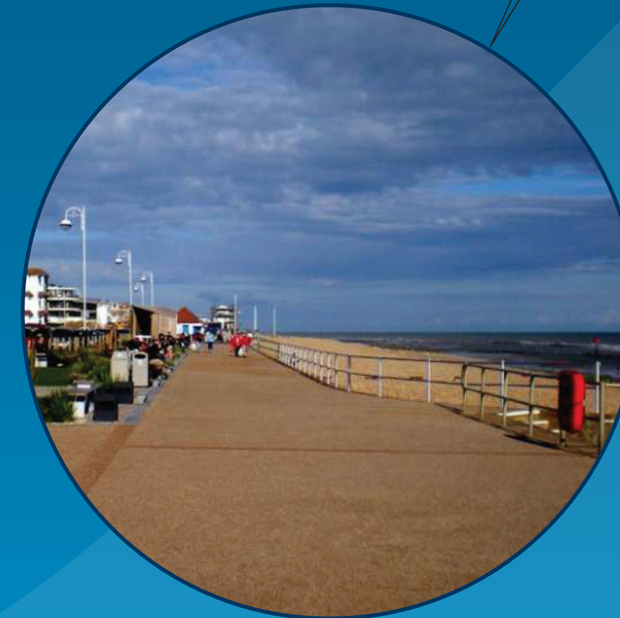
Example of bound gravel surfacing – colour and type as landscaping area.