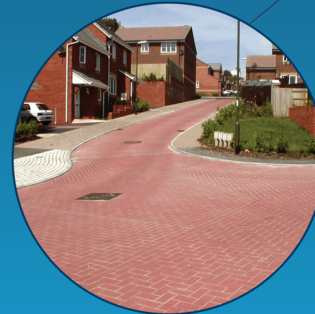
Example of a coloured road surface.