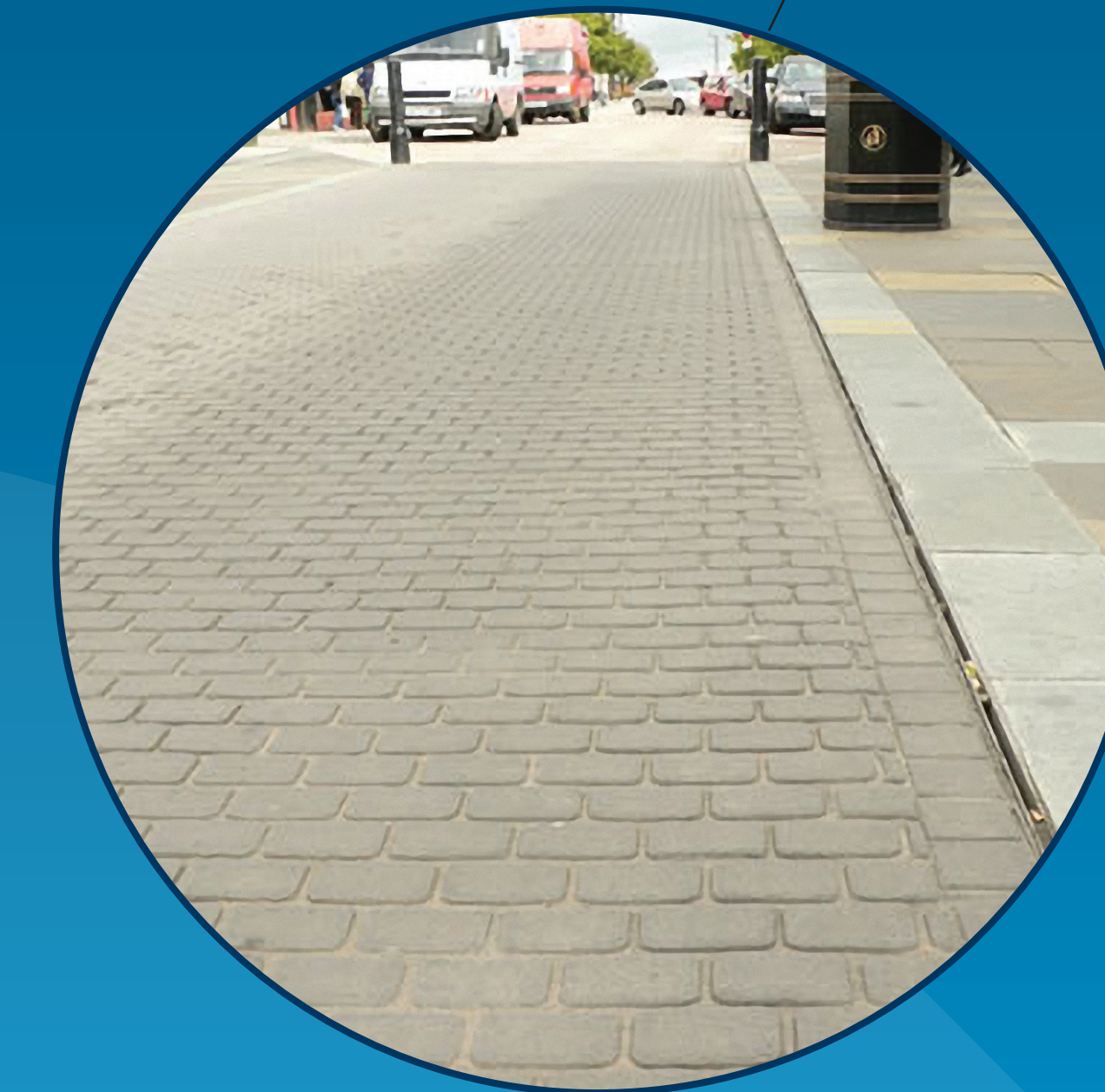
Example of carriageway surfacing effect.