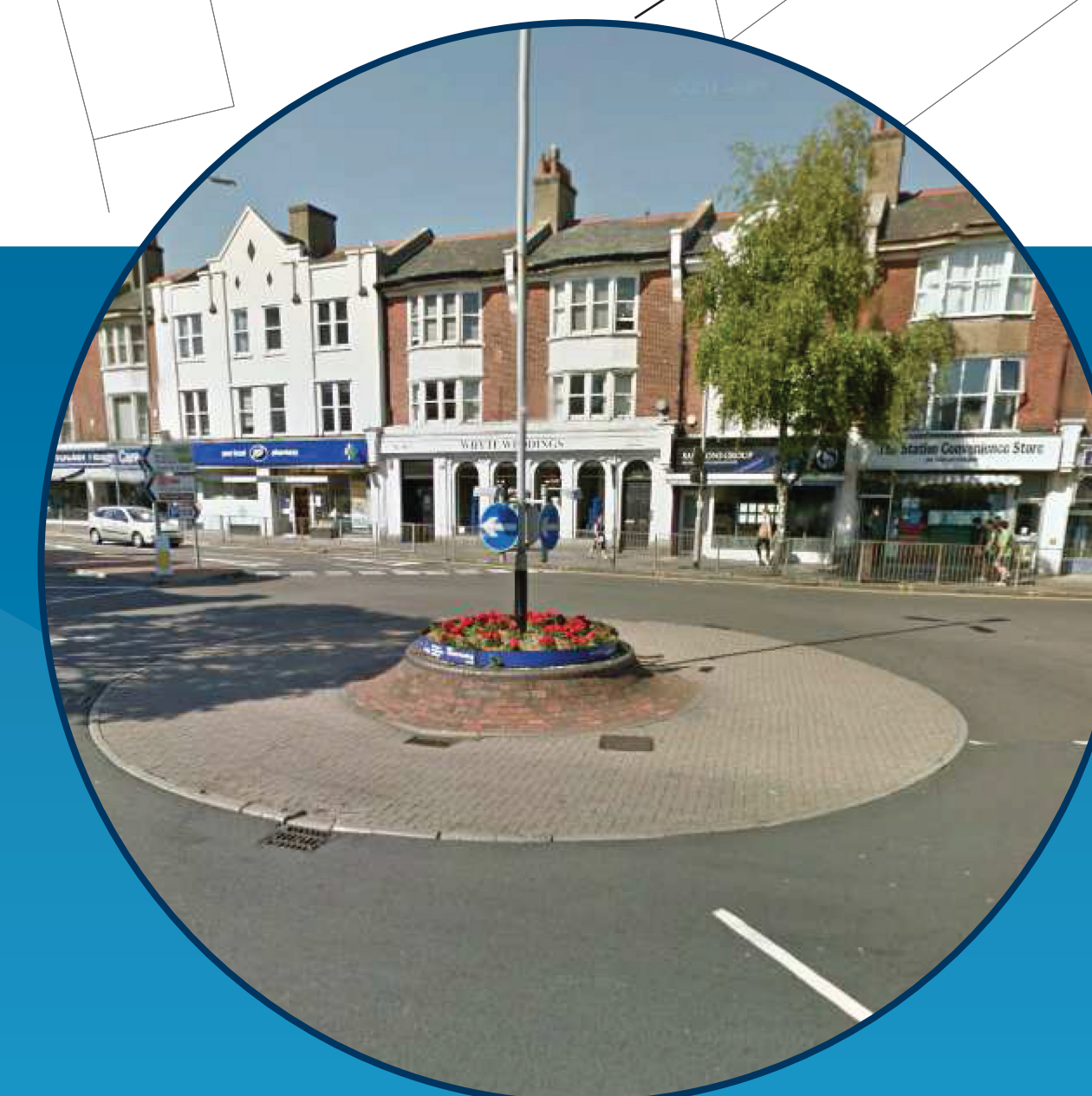
Example of roundabout with overrun area.