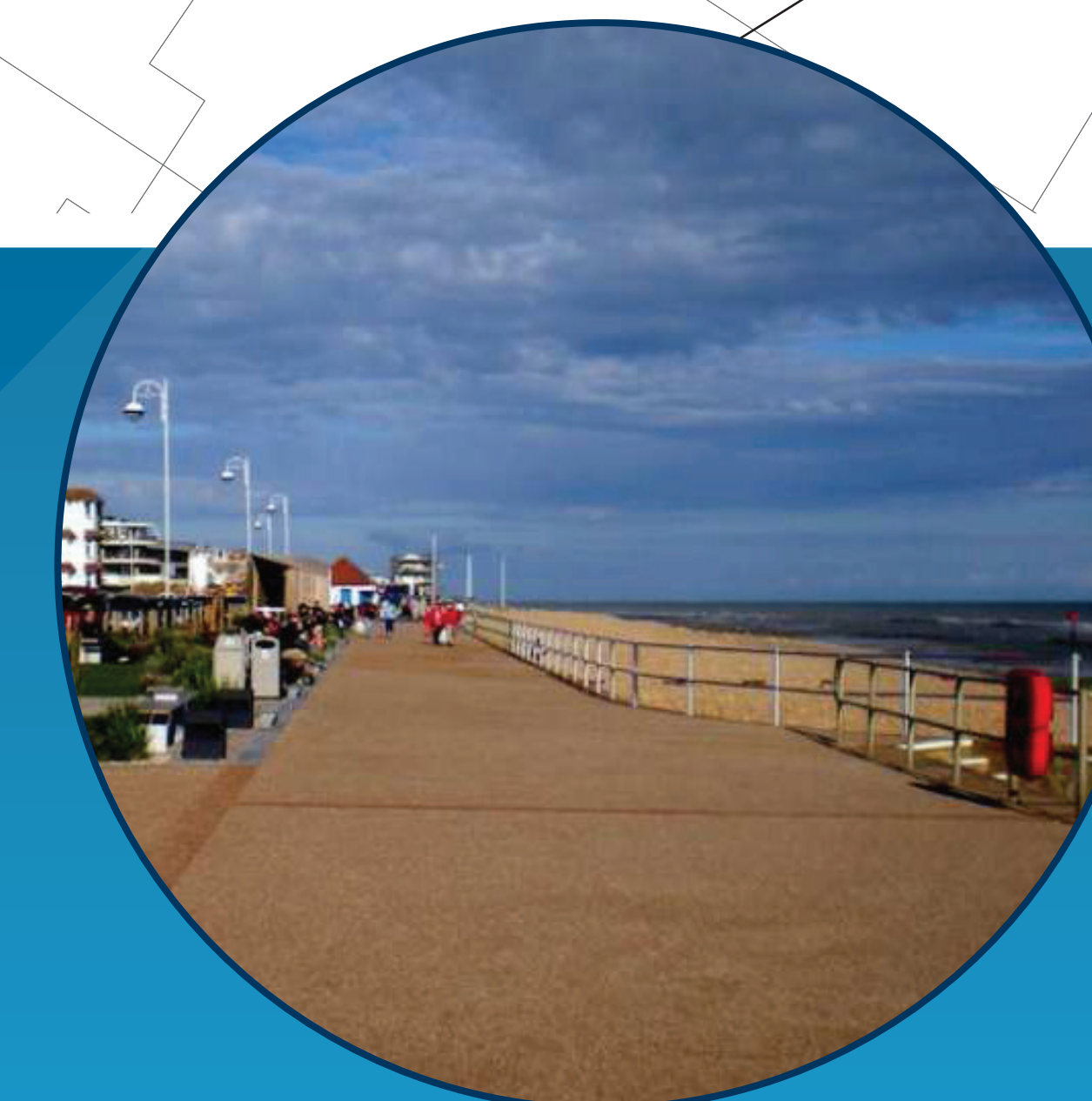
Example of bound gravel surfacing to be laid on all 3 pedestrian islands – colour and type as per Phase 1.

Existing footways to be widened and new materials to match existing, where applicable.